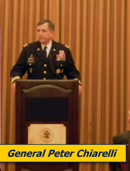
General Peter Chiarelli