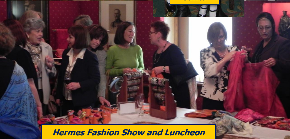
Hermes Fashion Show and Luncheon