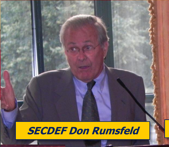
SECDEF Don Rumsfeld