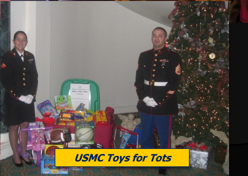
USMC Toys for Tots