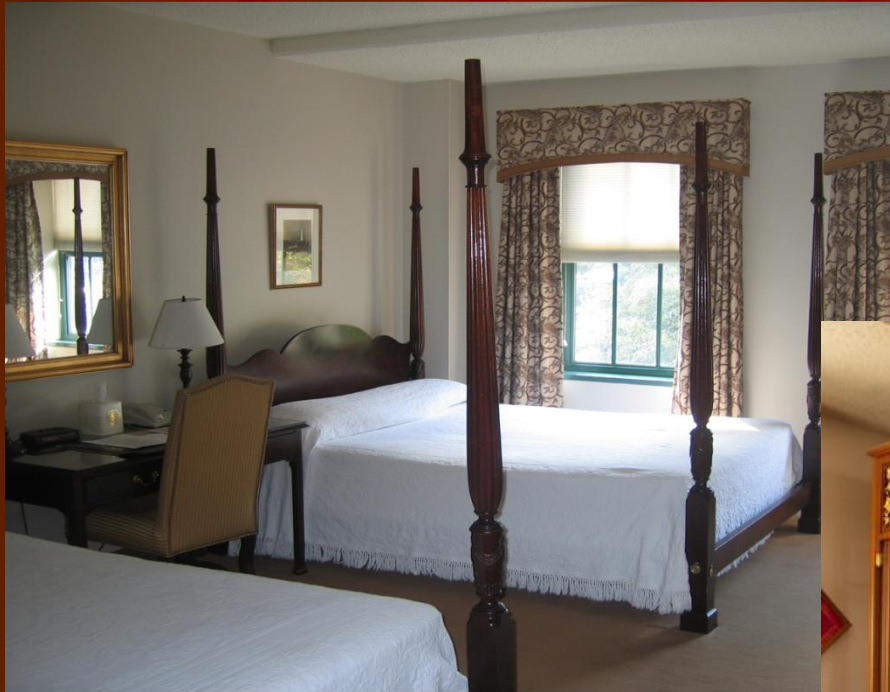
Chinese Suite – Gift of the Republic of Taiwan