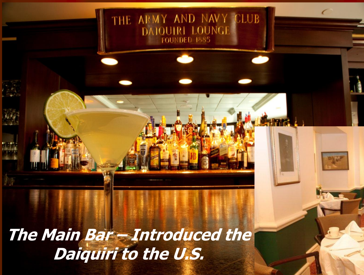
The Main Bar – Introduced the Daiquiri to the U.S.