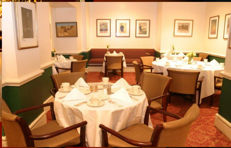
The Eagle Grill Informal Dining