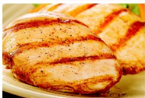
Boneless Chicken Breasts