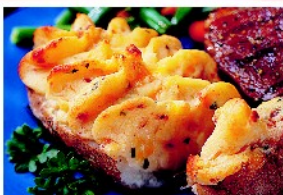
Stuffed Baked Potatoes