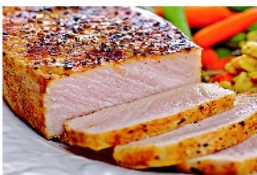
Boneless Pork Chops