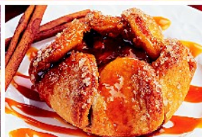
Caramel Apple Tartlets

Order the Omaha Steaks Favorites Collection, ONLY $59.99!